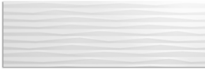
Pamukkale-R Blanco G.244

33,3x100 cm. (32x99 cm. ) 13.1x39.4 inches (12.6x39 inches) 11 mm.