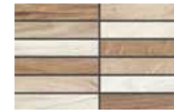
Foliage Mix 20x32 cm 8x12 5/8 in 265