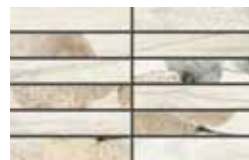
Mosaico / FI 10 20x32 cm 8x12 5/8 in □248