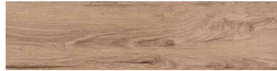
FI 9 30x120 cm 12x48 in 089 FI 9 Rett. 30x120 cm 12x48 in 099