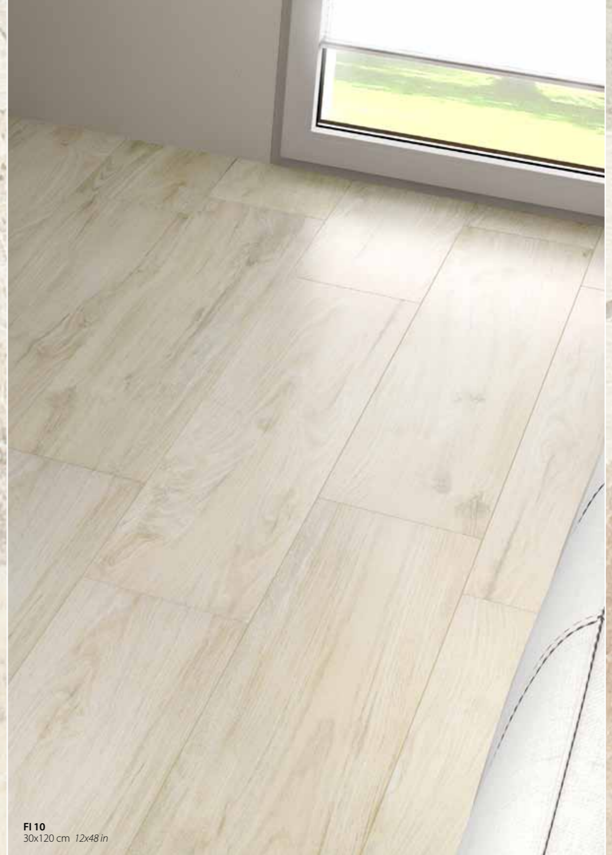
FI 10 30x120 cm 12x48 in