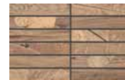
Mosaico / FI 9 20x32 cm 8x12 5/8 in 248