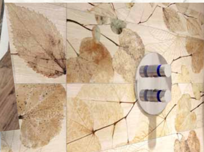
Fl 9 - Mosaico / Fl 9 - Fl 10 - Foliage / Fl 10