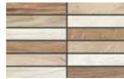
Foliage Mix 20x32 cm 8x12 5/8 in 265