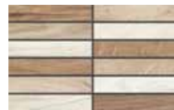
Foliage Mix 20x32 cm 8x12 5/8 in □265