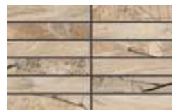
Mosaico / FI 1 20x32 cm 8x12 5/8 in 248